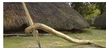
ard and coultter

The Stone Age was called this as they used stone to make tools and weapons. In the Stone Age hunter-gatherers had to catch or collect everything they ate. They lived in caves until they learned how to make simple shelters.